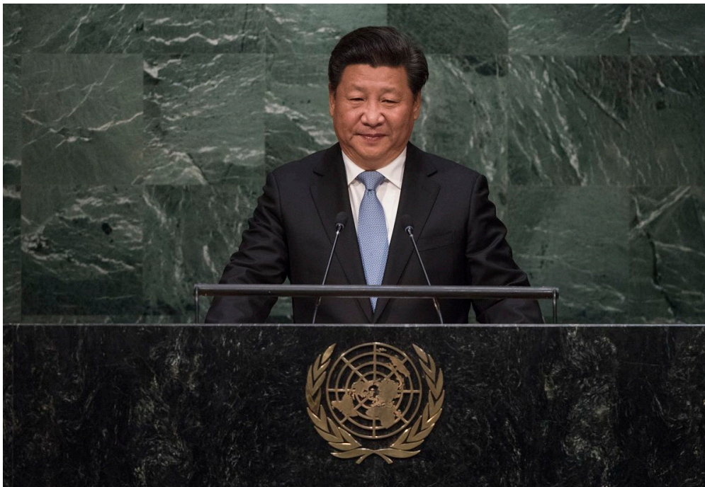
China sees itself as the rising great power and the United States as a declining one. China's President Xi Jinping addresses the United Nations General Assembly

By all accounts, Beijing also views the world through this prism. 35 China sees itself as the rising great power and the United States as a declining one. Great power competition also explains much of China's behaviour towards Australia. Viewed from Beijing, Australia appears to be a problematic anomaly: a mid-sized regional state that is stubbornly allied to the United States despite its economic interdependence with China.