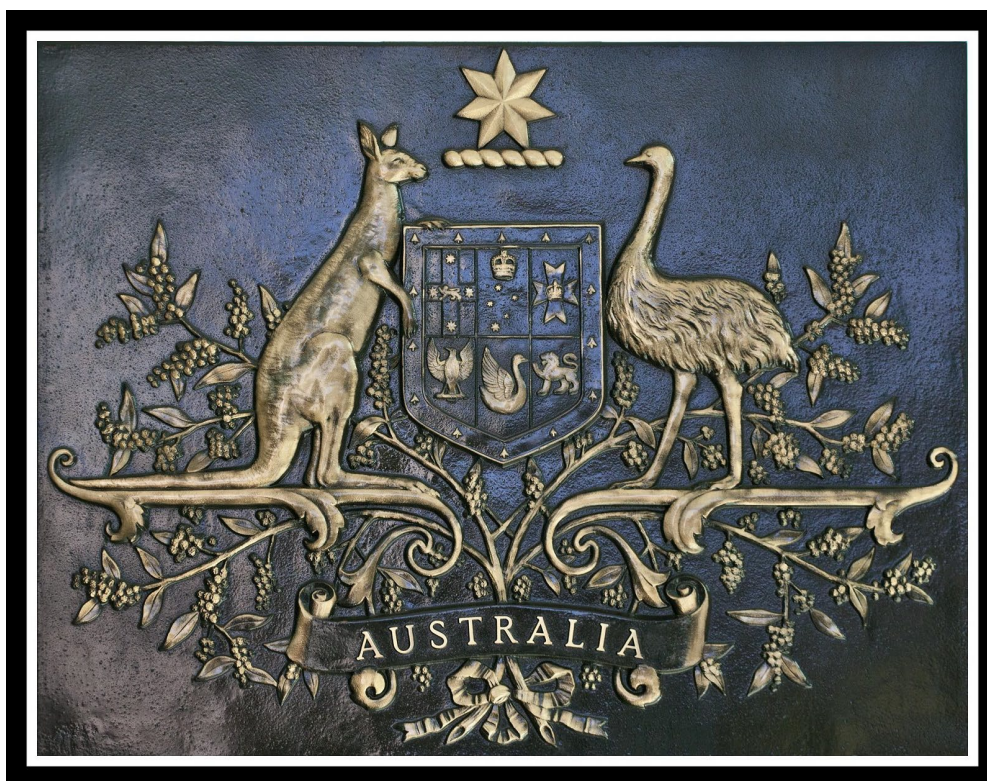
Australia's national security architecture must evolve to meet new challenges

Australia's national security architecture must evolve to meet these new challenges, as it has before. The bureaucracy has undergone significant reform in recent years, including the merger of the Department of Foreign Affairs and Trade (DFAT) and AusAID, the establishment of the Department of Home Affairs, and the creation of the Office of National Intelligence (ONI). One possibility would be to further reorganise this bureaucracy with the goal of making it more integrated, flexible, and so better equipped for the new environment. But in a time of uncertainty, another major restructure might only exacerbate instability and produce more costs than benefits.