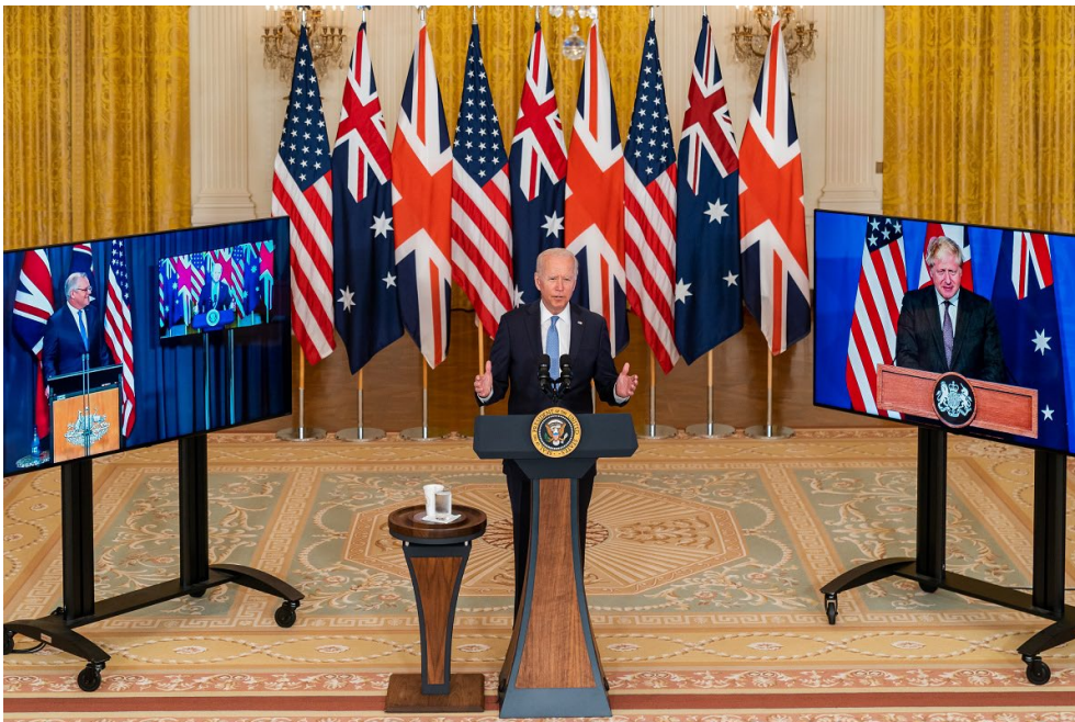
US President Joe Biden at a trilateral press statement with Australia and the United Kingdom to announce AUKUS, 15 September 2021

Canberra's two biggest calls in this period have been its August 2018 decision to exclude "high risk vendors", principally the Chinese company Huawei, from tendering for Australia's 5G network and the September 2021 announcement that Australia would acquire nuclear-powered submarines as part of a new trilateral security and technology partnership with the United States and the United Kingdom known as AUKUS.