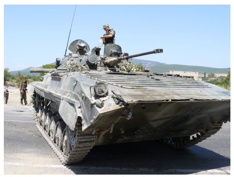
Vladimir Putin has readily resorted to military force in Georgia, Syria, Ukraine, Iraq, Libya, Mali, and the Central African Republic. Pictured: Russian troops on the highway linking eastern and western Georgia, 19 August 2008

China is invested in global order, albeit one where it exerts considerably greater influence than at present and where, correspondingly, US (and Western) dominance is much reduced. Xi has talked about China assuming a global leadership role, but this is about being a global leader, not the global leader.<sup>20</sup> Moreover, he seeks to realise this aspiration by working within the international system. The steady growth of Chinese participation in United Nations bodies points to an inside player that games the system to maximum advantage. Beijing's approach is essentially parasitic and incremental — it operates to expand its influence within the host body and thereby to "reform" it. China is undoubtedly a revisionist power, but not a revolutionary one in the sense of wishing to demolish the international order.