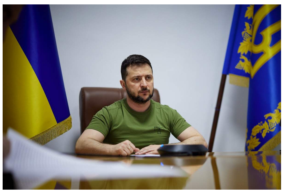
Volodymyr Zelensky delivers a speech in the Riigikogu, Estonian Parliament, 13 April 2022

The course of the latest Russian invasion of Ukraine<sup>22</sup> has confounded expectations in Moscow and Beijing. Instead of achieving a quick victory, Russia's armed forces have suffered huge losses and failed to achieve their original objectives: the occupation of Kyiv and other major cities; the elimination or surrender of President Volodymyr Zelensky and his administration; and the end of Ukraine as a sovereign democratic state. Instead, the Ukrainian resistance has been remarkably effective, and President Zelensky has emerged as an heroic figure both domestically and internationally.