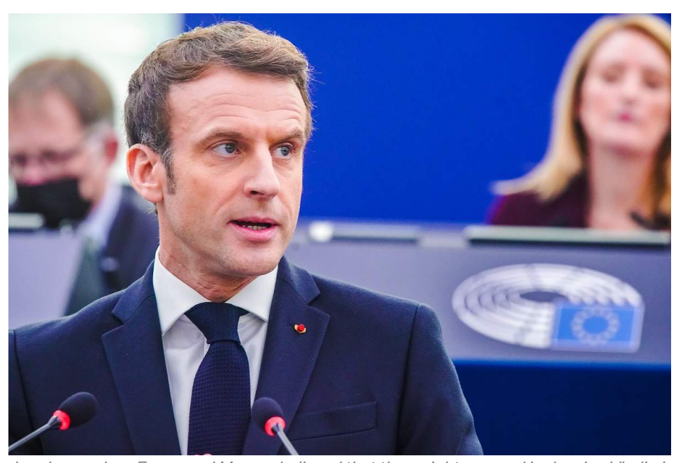
Leaders such as Emmanuel Macron believed that they might succeed in drawing Vladimir Putin away from Xi Jinping

Distinguishing between China and Russia is a necessary first step to addressing the challenges posed by their strategic partnership. At the same time, any illusions about "wedging" Moscow from Beijing or vice versa should be ditched. The reality is that neither party will voluntarily sacrifice a partnership that has benefited them greatly. Even in the worst-case scenario for Moscow and Beijing — a comprehensive military and political defeat for Putin — the partnership will continue to function in some form. It cannot be magicked away, least of all by a West distrusted and disliked in both capitals.