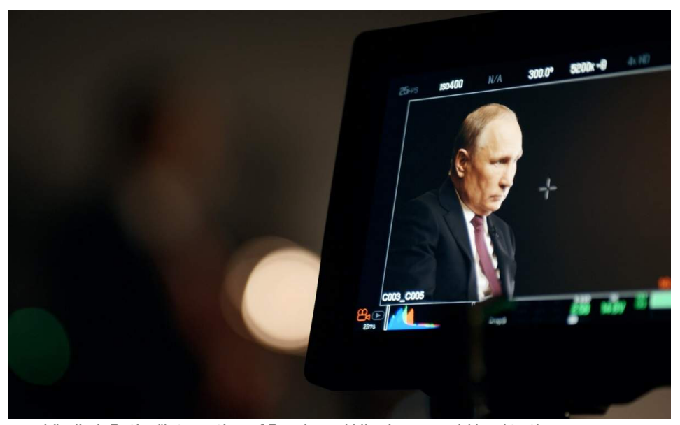
Vladimir Putin: "Integration of Russia and Ukraine...would lead to the emergence of a rival, a global rival for Europe and the world."

Finally, the overall tone of the statement was defensive. This was reflected not only in the claim about "long-standing traditions of democracy" in China and Russia, but also in the almost unrelenting criticism of US and Western policy throughout the text. Although there were the usual references to the "redistribution of power in the world", "the democratisation of international relations", "multipolarity", and a "polycentric world order", as well as to Xi's "community of common destiny for mankind", the statement read more as a diatribe against the West than a celebration of Sino–Russian cooperation. It was lacking in the triumphalism that has marked many Chinese and Russian public utterances over the years.