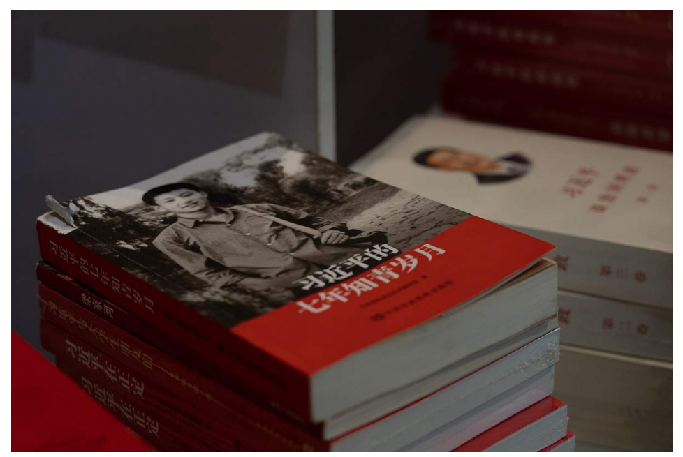
A joint statement from the Xi–Putin summit of 4 February 2022 spoke of Xi's desire for a "community of common destiny for mankind". Pictured: Xi's Seven Years as an Educated Youth, from the Xi Jinping Thought series

criticised the North Atlantic Treaty Organization (NATO) for the first time, as well as the AUKUS trilateral security pact between Australia, the United Kingdom, and the United States; the Quad security dialogue (Australia, India, Japan, the United States); and the US alliance system in general. It also stressed the destabilising impact of America's withdrawal from various arms control agreements. Although the statement did not mention Ukraine by name, it noted that "the Chinese side is sympathetic to and supports the proposals put forward by the Russian Federation to create long-term legally binding security guarantees in Europe" — a reference to two draft agreements published by the Russian Foreign Ministry in December 2021 on US–Russia and Russia–NATO relations, respectively.<sup>8</sup>