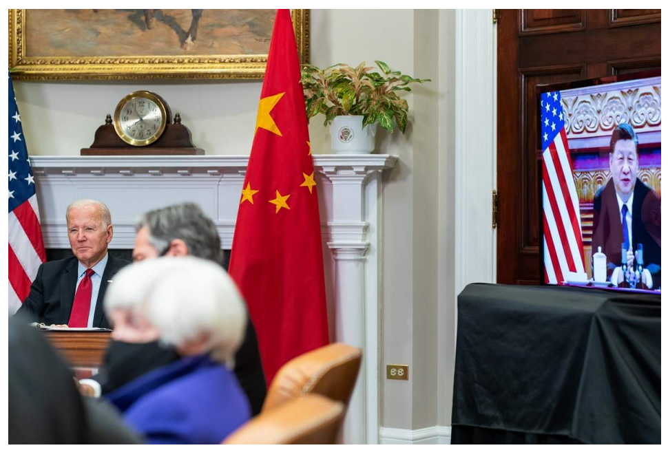
Joe Biden participates in a virtual bilateral meeting with Xi Jinping, 15 November 2021

The war in Ukraine is about much more than the future of a sovereign democratic nation. At stake is the fate of the post-Cold War settlement in Europe, the viability of the West as a political and normative entity, and the very idea of international order. A Russian victory would see the return to a divided Europe, but without the safeguards of the Cold War era. Serial rules-breaking would become the new "normal" in international relations, as a Hobbesian dystopia of "perpetual war" replaces the relic of the "rules-based international order". Inevitably, too, Beijing would draw conclusions from the example of Western weakness to expand China's geopolitical footprint in the Indo-Pacific, and assert its global leadership credentials.