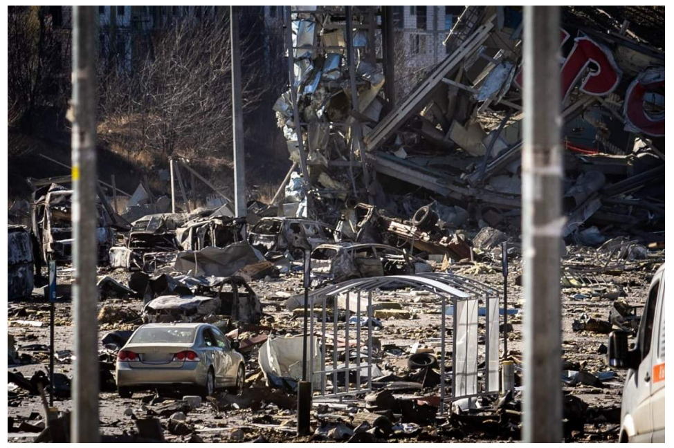
A shopping centre destroyed by Russian shelling in Kyiv's Podilskyi district, 20 March 2022

It is no great shock that Beijing should have allowed critical references to NATO to appear in the statement. Although NATO enlargement is a peripheral concern of Chinese foreign policy, the US alliance system in Asia, the Quad, and AUKUS are very much at the forefront of Beijing's concerns. It would have been odd to have left NATO off the blacklist, and incompatible with the image of Sino-Russian solidarity that Xi and Putin were aiming to project.<sup>12</sup> The same is true of arms control, where Beijing and Moscow have their own particular priorities, but share a common concern about US missile defence plans. What was more noteworthy was the tepid language on Russian proposals for European security — "the Chinese side is sympathetic to and supports …". This hinted at a lack of enthusiasm in Beijing for Moscow's approach to Ukraine even before the invasion.<sup>13</sup> (If China had wanted to signal unequivocal backing for the Russian position, it could just have stated that "the Chinese side fully supports …".)