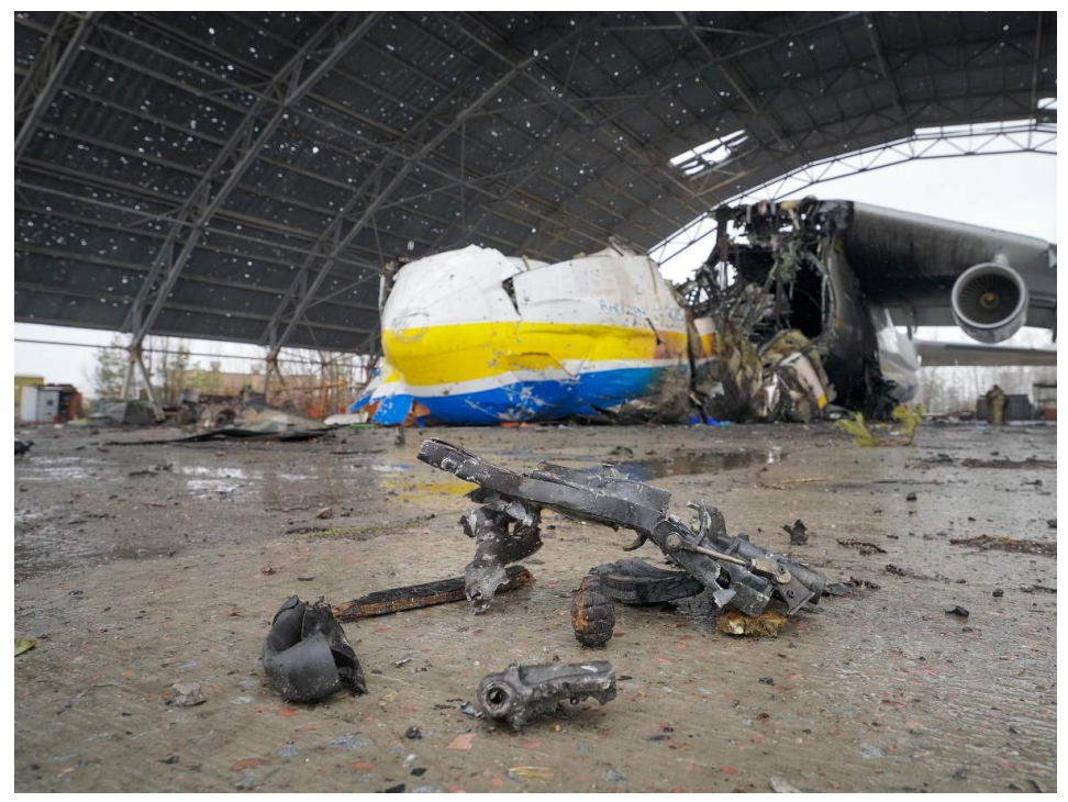
Antonov Airport in Hostomel on 3 April 2022 after the Kyiv offensive of Russia's invasion of Ukraine

Thus far, Beijing has been cognisant of Moscow's sensitivities about inequality — talking up Sino-Russian friendship, Russia as a great power, and Putin as an outstanding leader. For the time being, it would look to keep Moscow onside. The strategic partnership would be less central to Chinese foreign policy than before, but remain important. Indeed, in the immediate aftermath of defeat, Xi might take extra care to massage the Kremlin's bruised feelings and defuse possible suggestions that China could have done more to help Russia in its time of need. A weakened Russia could either be a sullen contrarian that complicates the realisation of Chinese goals, or a useful (if diminished) partner in counterbalancing the United States.