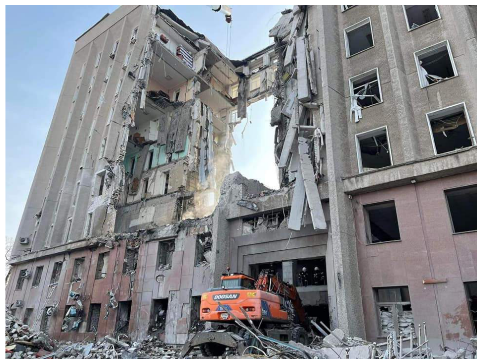
A Russian rocket strike on a building in Mykolaiv, Ukraine, 29 March 2022, in which dozens were killed or injured

The biggest game-changer for the Sino–Russian partnership could be if Putin's invasion succeeds in achieving all or most of its current objectives: annexation of the whole of the Donbass; capture of the port city of Odessa; and closing off Ukraine's access to the Black Sea. If Putin were able to parlay these successes into forcing Kyiv to sue for a humiliating peace — his original purpose — the Kremlin's victory would be near-complete. Ukraine would remain formally independent, but no longer sovereign in the proper sense. It might have "neutral" status, but this would be a miserable version of the Finlandisation model advocated by some.<sup>43</sup> Ukrainian foreign and security policy would be dictated out of Moscow, and the economy would be emasculated.